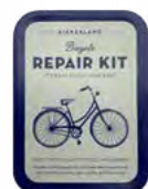
Bicycle Repair Kit

We have lots of lovely little stocking fillers available, with gifts to suit every budget. These are our top few picks, because who wants to receive an orange in their stocking? (Some items available at Little Budworth only)