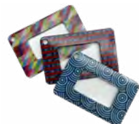
Credit card-sized Magnifying glass