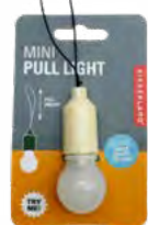
Mini Pull Light