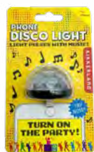
Phone Disco Light